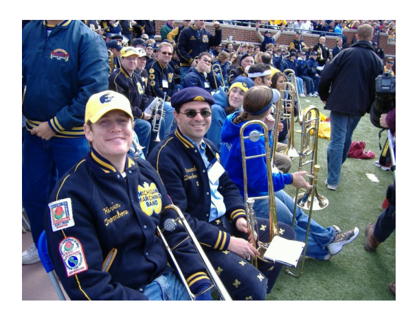
The Alumni Band takes in the Game