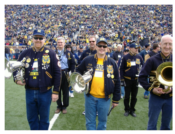
Someone was NOT standing at attention when this photo was taken during pregame! (Nor was the photographer, for that matter!)