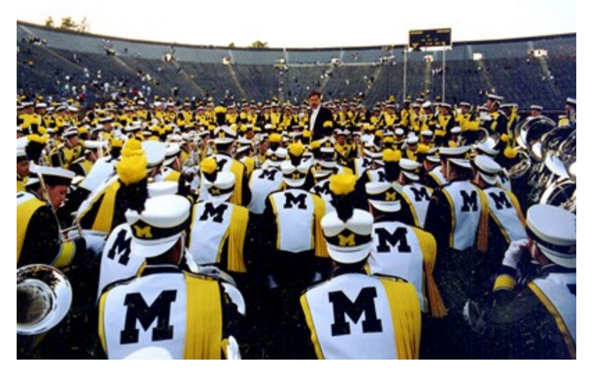
Quick — Name them! Oh, yeah, you'd need a Master Roster...