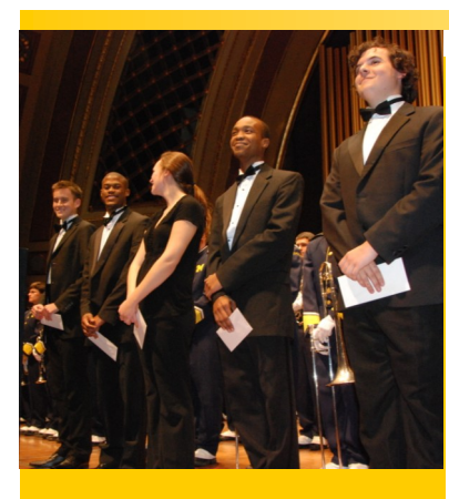
2011 UMBAA Scholarship Recipients Symphony and Concert Bands

The website requires users to be logged in before seeing the Membership and Concert Band forms. If you are not sure what email address we have for you or have any problems creating a login, send an email to <a href="mailto:umbaa-webmaster@umich.edu">umbaa-webmaster@umich.edu</a> including what band(s) you played in while at UM, your first year in the band, and the name you used when in the band.